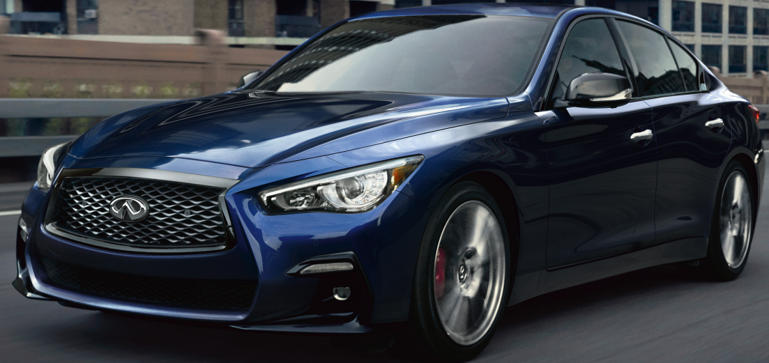
U.S. model shown.