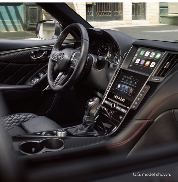
U.S. model shown.